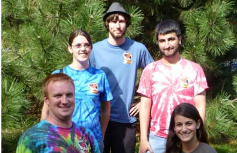
History Club members at Festival ISU 2010

Students meet to discuss a wide range of historical topics and listen to presentations from professors, community leaders, and their peers. This year's activities included student-professor lunches and the Evergreen Memorial Cemetery Walk, at which actors portray deceased local citizens. At one meeting, several history education students, who were undergoing their student teaching, held a discussion on what upcoming student teachers could expect from the experience. In another, representatives from the David Davis Mansion and