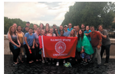
This summer ISU Orvieto took its largest group of ISU students to Italy. Here they are in Rome, June 2018.