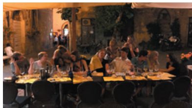
Students enjoy their "Last Supper" in Orvieto, Italy, June 2017

History currently participates in 15 interdisciplinary minors at Illinois State ranging from Children's Studies to Classical Studies. It has an especially significant presence in Women's and Gender Studies and already administers three other important interdisciplinary minors: African-American Studies, African Studies, and Urban