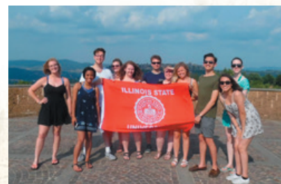
ISU students outside the hilltop town of Orvieto, Italy, June 2017